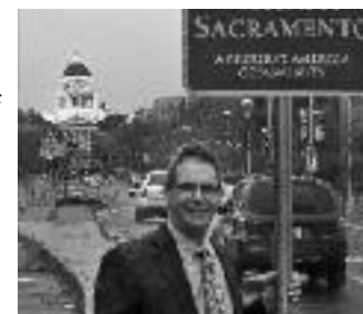
CSPS LEGISLATIVE DAY - MARCH 15TH SACRAMENTO, CALIFORNIA.

The CSPS met with Legislators working towards our goal of protecting California's patients.