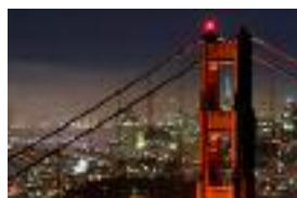
San Francisco Travel Association/Can Balcioglu

EXHIBITS & WELCOMING RECEPTION 5:30 PM – 7:00 PM